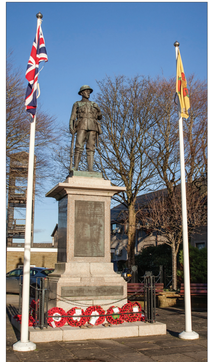
Carnforth War Memorial, unveiled 9 November 1924

On the 100th anniversary of the end of World War One, this leaflet commemorates those men who never came back. It also remembers those that they left behind. Not all families received a telegram from the King during the war telling them of the death of a loved one as in some cases wounded men died well after the end of hostilities but the effect was no less tragic on grieving households.